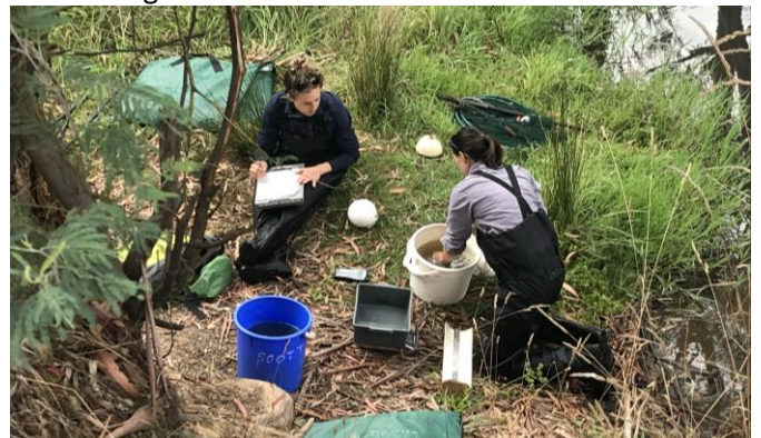
Photo 1. ARI Scientists measuring & weighing fish on Seven Creeks

Fish surveys in 2019 and 2020 revealed substantial declines in numbers of both Macquarie perch and Trout cod in the former stronghold and 3 km reach between Gooram Falls and Galls Gap Road where long term monitoring has occurred.