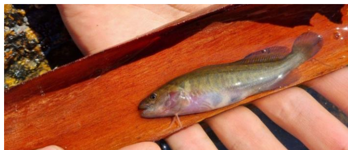
Photo 3. River blackfish

River blackfish are mostly restricted to sites above Gooram Falls and there has been a modest increase in numbers over the last 12 months including YoY (Photo 3).