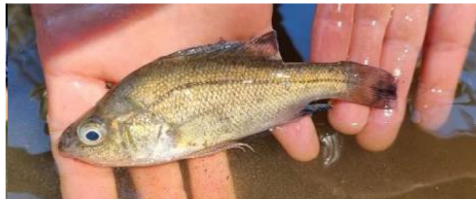
Photo 2. Macquarie perch 1-2 years of age

At the four sites surveyed above Gooram Falls, Macquarie perch numbers have slightly increased with 26 individuals captured. Sixty percent of the fish captured were 10-20cm and estimated to be 1-2 years of age.