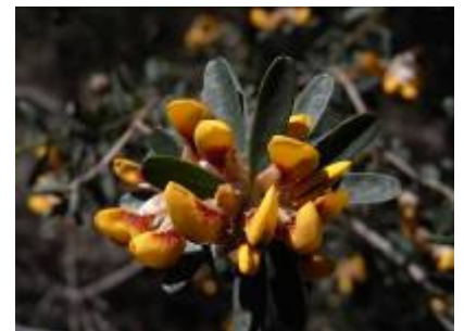
Flat-leaf Bush-pea Pultanea platyphylla

RSVP by Friday 9th September to Jim Blackney (03) 5728 6620 or 0419 842 082 or email jimb@tfn.org.au