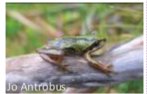
Alpine Tree Frog