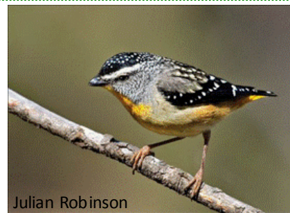
Spotted Pardalote