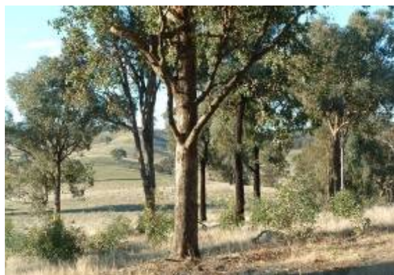
We always replant the understory shrubs that were lost due to grazing. This restores natural balances to keep the old trees healthy for the long term.