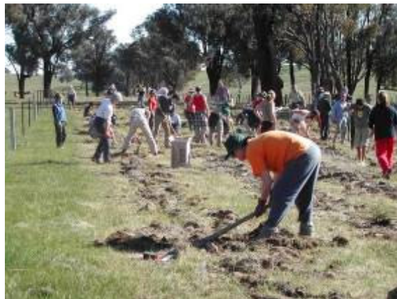
Volunteers hard at work on a planting site at Lurg. Big groups of people can plant thousands of seedlings in a weekend.

If you happen to see a Regent Honeyeater please report it ASAP to the National Regent Honeyeater Recovery Coordinator on Freecall 1800 621 056.