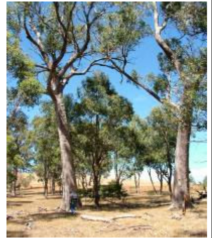
'Billygoat Hill' in drier times

RSVP Cathy Olive 0429 127 399, or uglandcare@gbcma.vic.gov.au