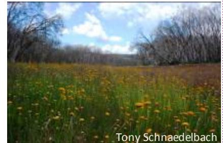
Tony Schnaedelbach Everlasting meadow at Lake Mountain