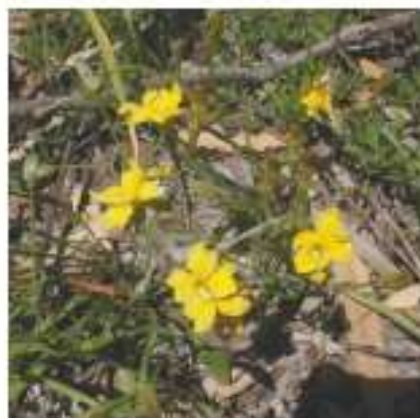
Goodenia ( Goodenia spp)