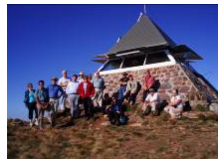
Right: At the fire tower on Mt Buller.