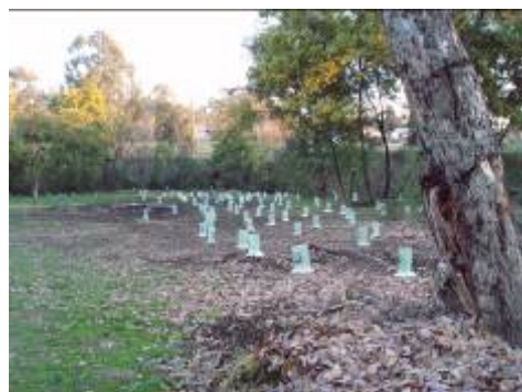
Revegetation of the Yea River after major removal of woody weeds.

The CMA has plans to celebrate its first 10 years throughout the Goulburn Broken community and information on events in each sub catchment area will be advertised.