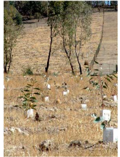
This strategic wildlife corridor connects the Upper Lurg bush blocks to the old growth roadside trees. It is the future route for Brush Tailed Phascogales to move back into Lurg!!