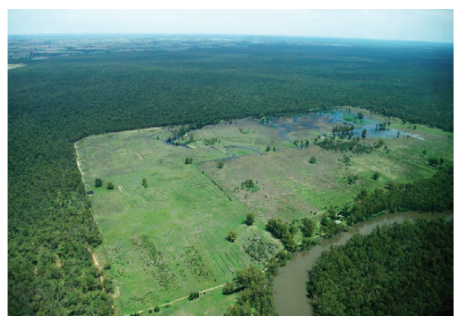
Aerial photograph of Yielima (15/02/2011)

Yorta Yorta are linked to other Indigenous owned and operated farms and farmers, for investigating and producing the best possible sustainable agriculture, carbon sequestration, and NRM programs on their farm-based assets, including for teaching and learning purposes with Yorta Yorta, other farmers and the broader community.