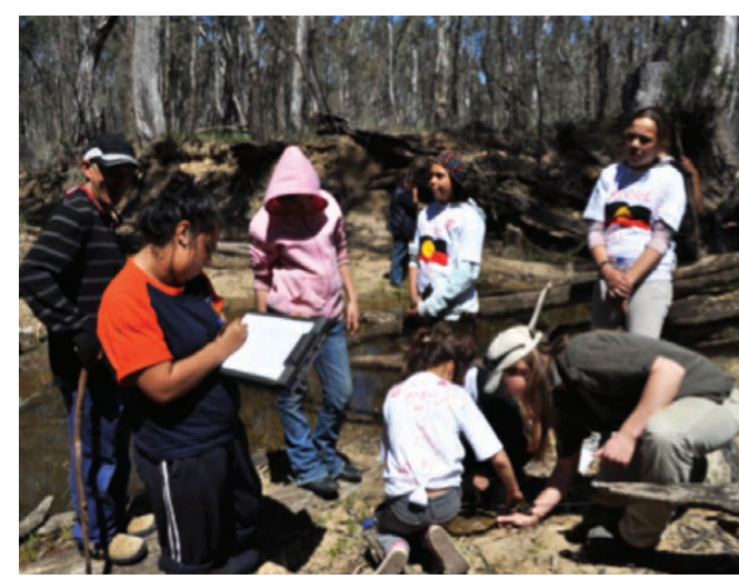
Yorta Yorta youth and a scientist from the Arthur Rylah Institute identify and measure a Common Long-necked Turtle, located during the terrestrial survey