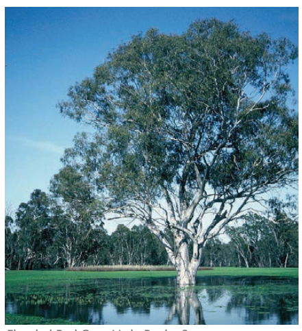
Flooded Red Gum Little Rushy Swamp