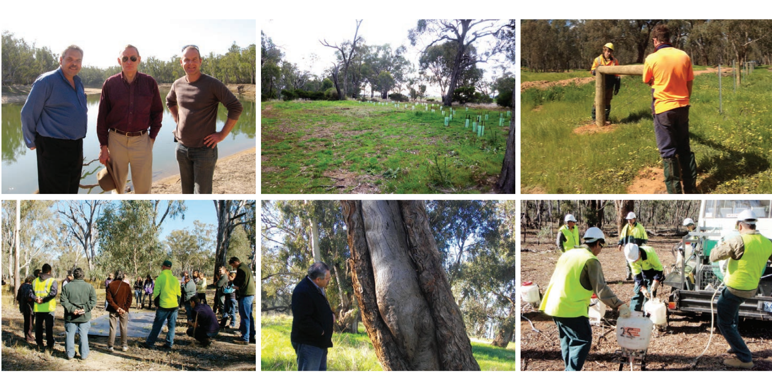
'Gaka Yawall Ngulla Yenbena Yorta Yorta Woka' 'Come walk with us the people on Yorta Yorta Country'