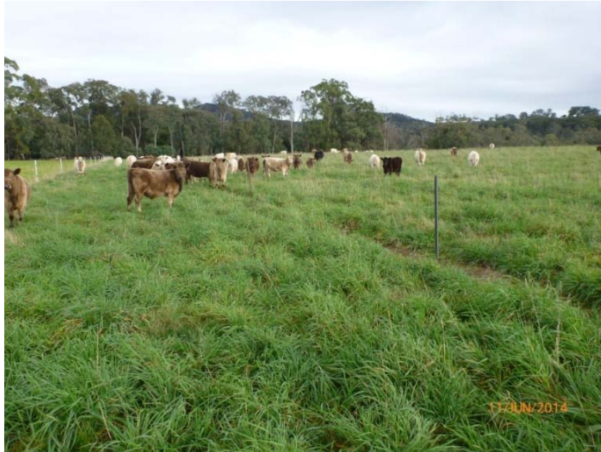
Cattle grazing at the site in one of the four replication blocks.