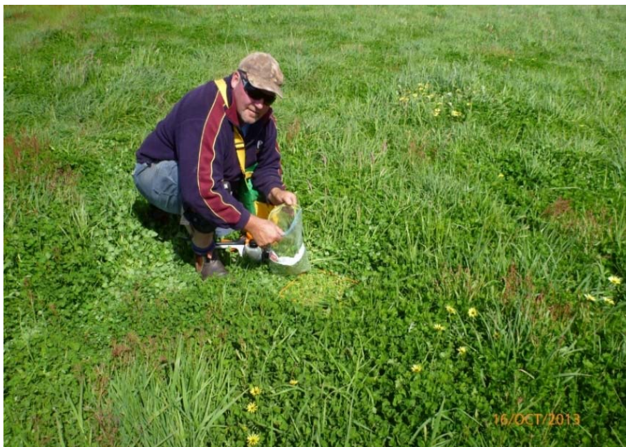
Greg Bekker from DEDJTR taking pasture cuts.