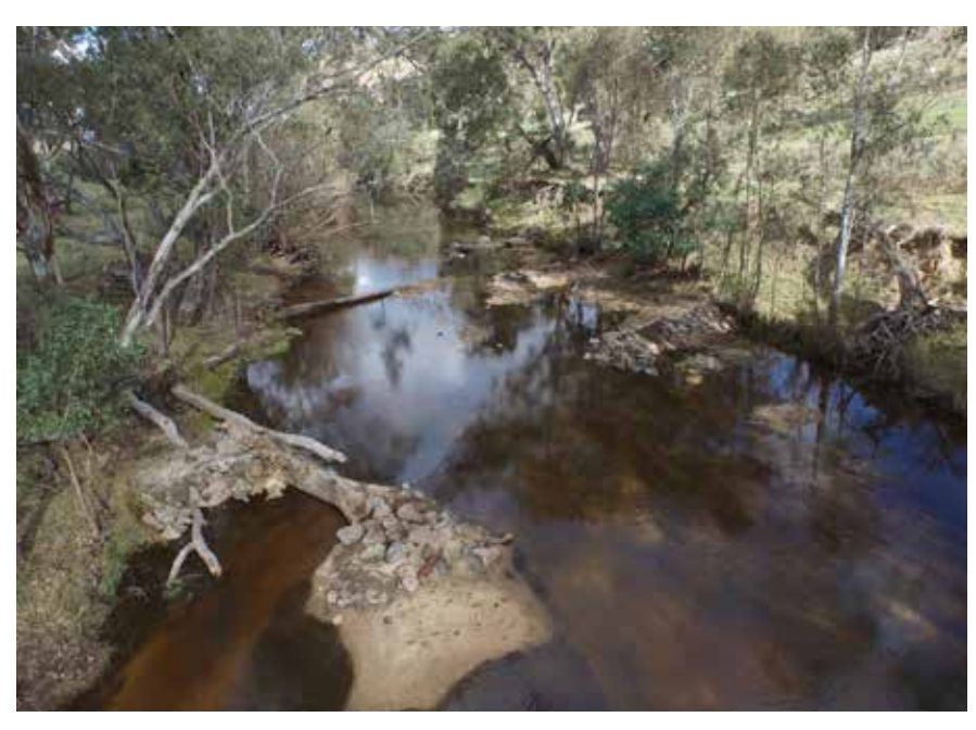
Figure 5: Instream habitat works – large wood and boulders placed to encourage depth in channel and sand deposition along bank.