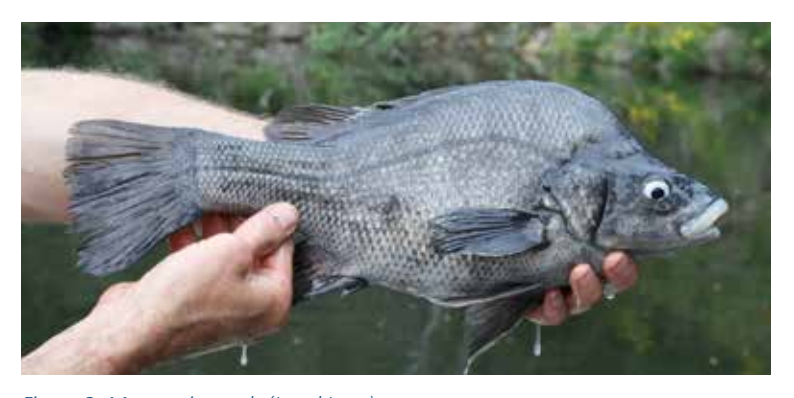
Figure 3: Macquarie perch (Jarod Lyon).