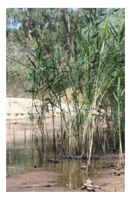
Figure 4: Macrophytes stabilising sand along the bank. As they bend in high flows they do not contribute to flooding.

Carp when caught, cannot be returned to the stream, while Macquarie perch are protected and must be returned as swiftly and sensitively as possible.