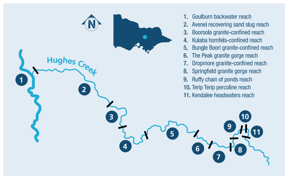
Figure 1: Map of Hughes Creek River Reaches - defined stretches of stream with similar characteristics.

Once widespread, this species has declined dramatically since the 1920's, with remaining populations relatively small and isolated. There are 11 known populations remaining in Victoria, including one small population here in the Hughes Creek.