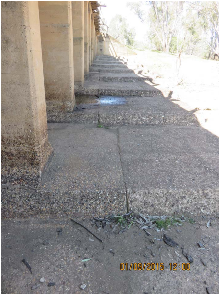
PHOTOGRAPH No.34. Construction joints in apron slab.