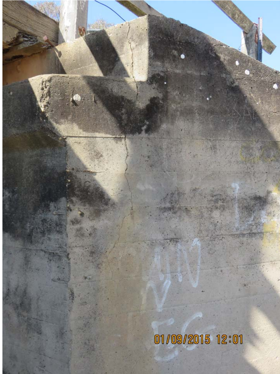
PHOTOGRAPH No.36. Cracks in southern abutment on downstream side.