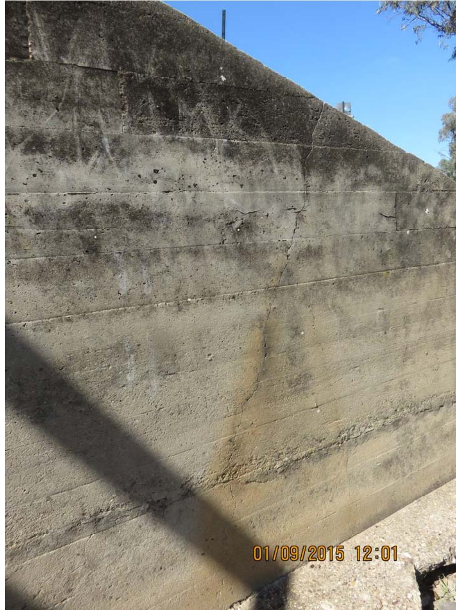
PHOTOGRAPH No.37. Radial crack in wingwall of downstream side of southern abutment.