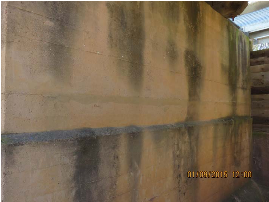
PHOTOGRAPH No.33. Previous crack repairs.