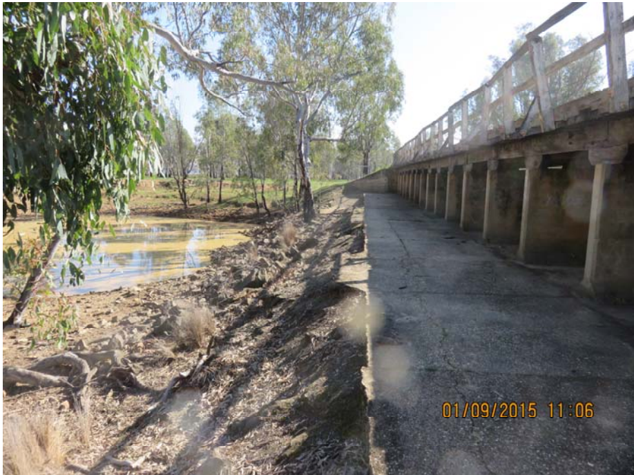
PHOTOGRAPH No.31. Undercut outfall apron. Note cracked apron slab.