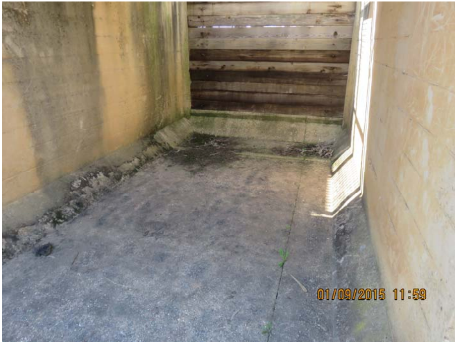
PHOTOGRAPH No.32. Exposed construction joints in floor of outlet cells.