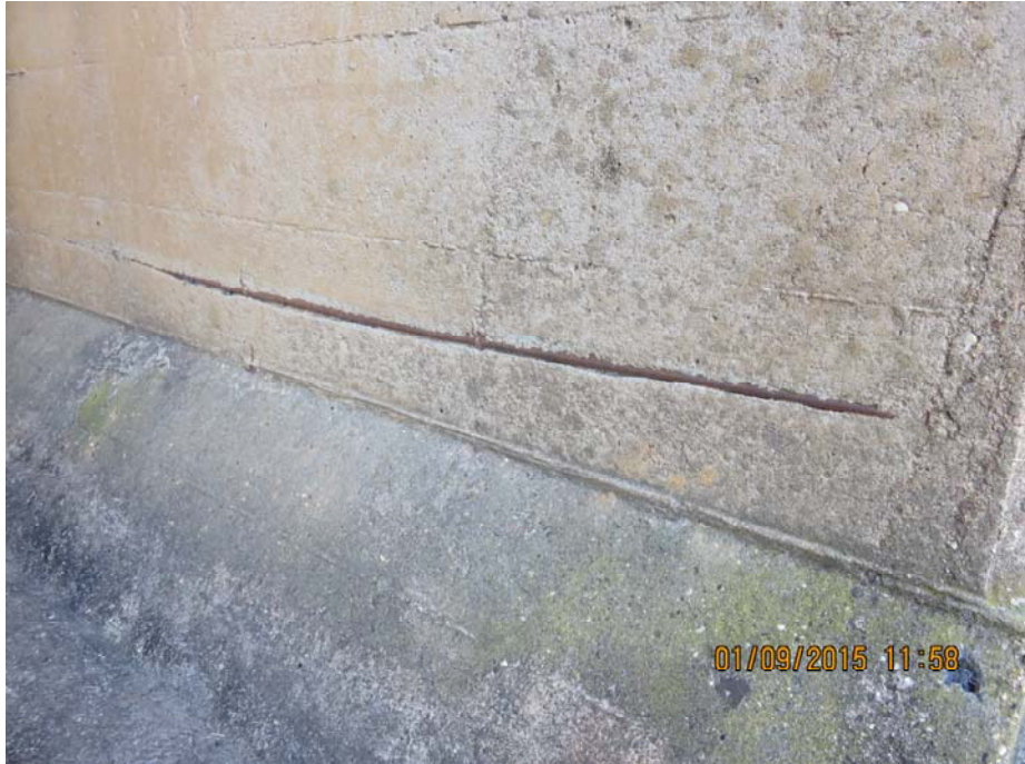
PHOTOGRAPH No.29. Exposed reinforcement.