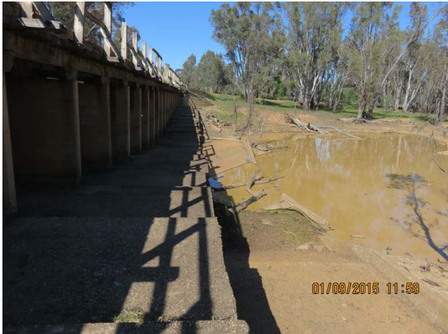
PHOTOGRAPH No.30. Note debris retained in chutes on downstream side of outlet structure.