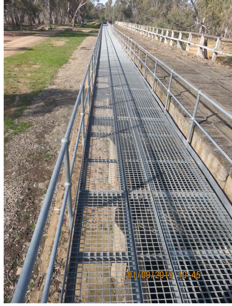
HOTOGRAPH No 28