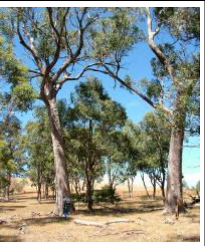
'Billygo at Hill' in drier times

RSVP Cathy Olive 0429 127 399, or uglandcare@gbcma.vic.gov.au