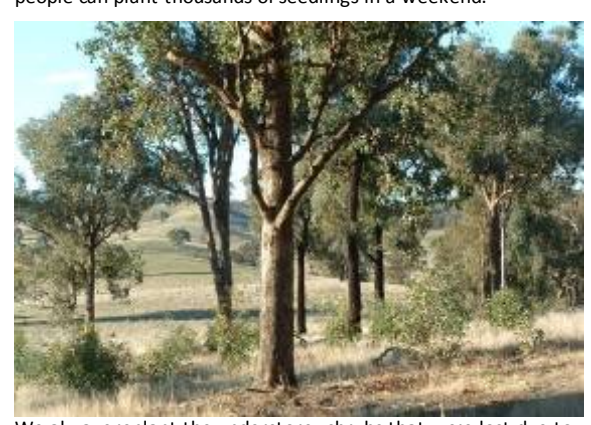
grazing. This restores natural balances to keep the old trees healthy for the long term.