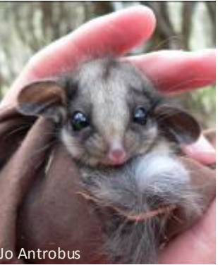
Juvenile Leadbeater's Possum