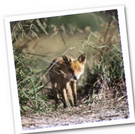
Fox—(Renard) Fr. Cunning and deadly

That consumption generally consists of small native animals and farm stock. Landholders should be well into their fox control program at least 6 weeks before lambing.