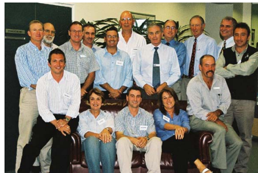
Lake Mokoan Future land Use Steering Committee and Agency observers at their first meeting.

A communication strategy is in place to ensure that the community is kept informed of the Committee's progress and that interested parties can be involved in the vision forming process. The website www.lakemokoan.com.au will be regularly updated to keep the community informed.