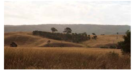
Trees regenerate naturally if protected.

Applications for the current roll out of Bush Returns are available on the web at www.gbcma.vic.gov.au .