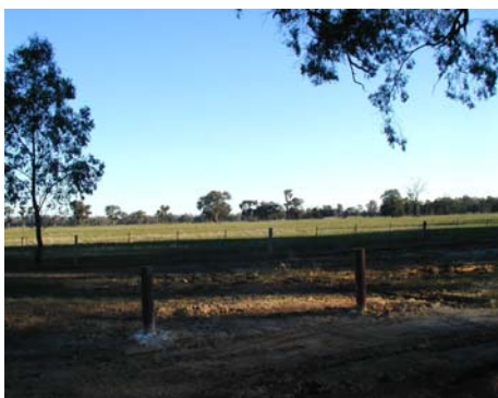
Landholders property prepared for Heartlands revegetation program in the Violet Town, Caniamba region.

The Conference encourages students from years 5 to 11 to be a part of an International Forum of "kids teaching kids" in an environment where they feel comfortable performing in front of their peers. Conference organisers, Firestarter Communications run by Aaron Wood, have prepared a fabulous schedule of events for the delegates who will come from all over Australia and overseas. It is anticipated that as many as 500 students will converge on the Murray River at Mildura for the three day event.