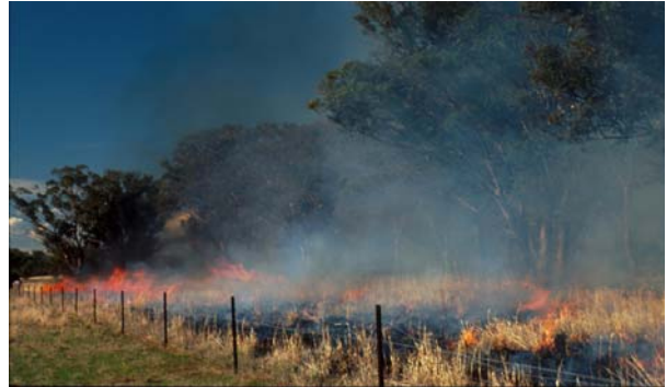
Burning off to restore natural habitat for threatened species

indigenous canopy trees can be planted. The heat and smoke will certainly assist those wonderful little Australians we don't see much of any more, and restore a spectacular wildflower display that has been declining for half a century. It will also reduce excess fuel loads and assist weed eradication through follow-up spraying. For further information on this project please contact Ray Thomas Ph 5761 1611.