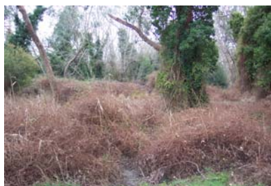
English Ivy strangles native vegetation in the Strathbogie's

For details of the program contact Geoff Brennan 5761 1585 or 0407 357 354.